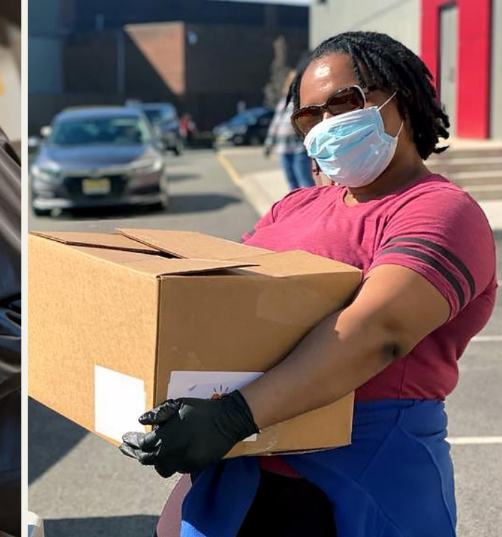
Meadowlands YMCA, East Rutherford, NJ